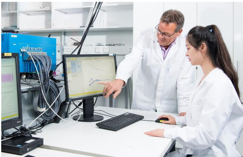
Researchers test cycle stability of the improved lithium-ion cell.

Within the Si-DRIVE European Research Project, KIT, HIU, and Partners Will Develop Innovative Solutions – Their Goal Is to Establish a European Lithium-ion Battery Production