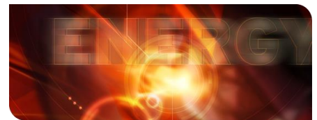
KIT Energy Center: Having future in mind

Presently, about 90 percent of the lithium-ion cells are produced in Asia. Various efforts are being undertaken to establish battery production in Europe. Si-DRIVE is aimed at developing a cell that consists of a nanostructured silicon anode, a novel solid electrolyte based on ionic liquids, and a completely cobalt-free, but lithium-rich cathode. A cell of this type and a comprehensive recycling program might enable sustainable battery production.